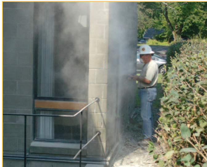
◀ 08-28-12 – Western Building Renovation Inc. mason removing block to replace insulation on W. wall of Chapel