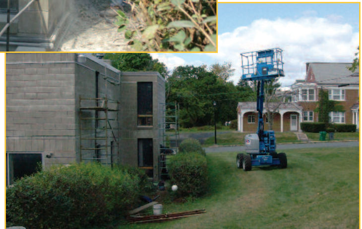
09-12-12 – For the hard-to-reach work, Western Building Renovation brought in a knuckle lift, which was great as long as it was dry!