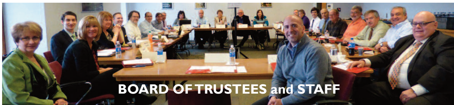
BOARD OF TRUSTEES and STAFF